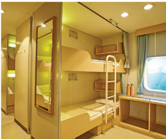
DORMS LARGE WINDOW