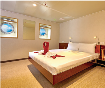
COUPLE ROOM DOUBLE BED & PORTHOLES