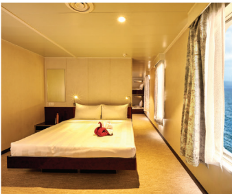
FAMILY ROOM ( KIDS' BUNK ) LARGE WINDOW / NO WINDOW