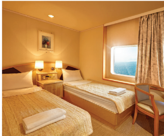
BUDDY ROOM WITH LARGE WINDOWS / NO WINDOW