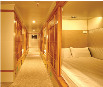
LUXURY PODS WITH DOUBLE BED & NO WINDOW